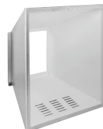
Type 419355 Molecone