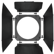
Type 419104 4-Way Light Shield